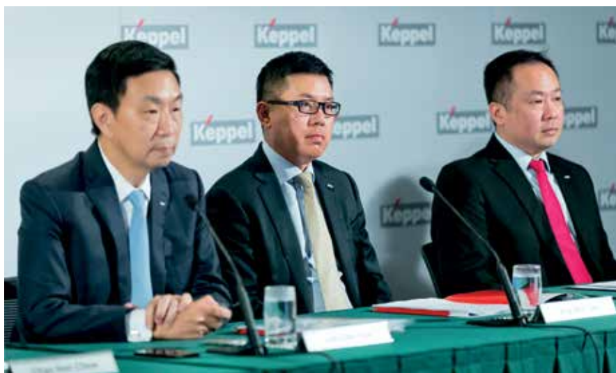
Keppel management answering questions at the company's 3Q & 9M 2017 results

OffshoreMarine presents highlights of Keppel Corporation's 3Q & 9M 2017 results webcast Question & Answer session with the media and investment community.