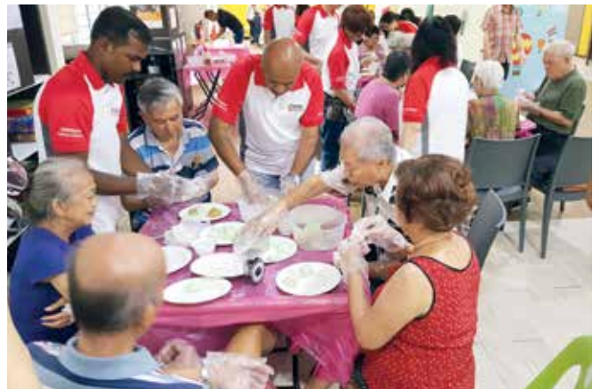
Elderly and beneficiaries bonded over mooncakes and tea that they made together