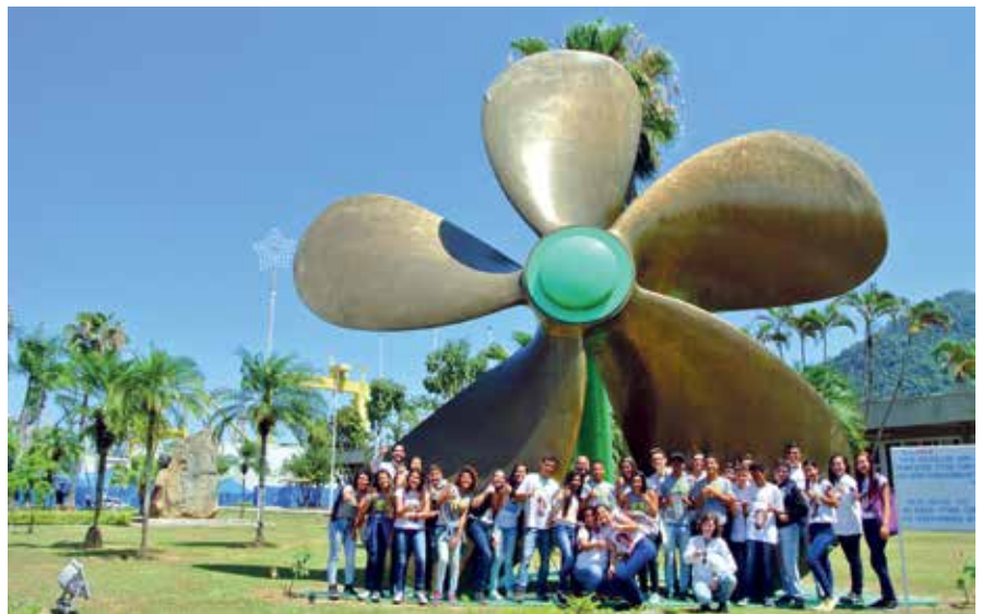
BrasFELS received a visit from 30 ninth-grade students from Amelia Araujo Lage Municipal School, located at Garatucaia neighbourhood