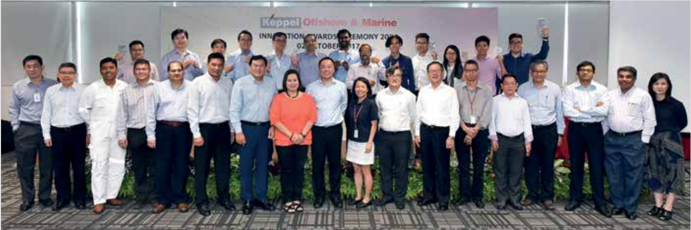
Senior management from Keppel Offshore & Marine with the award winners

Innovation and technology have been an integral part in the growth of Keppel Offshore & Marine (Keppel O&M) and the company is continuing to invest in these areas to maximise its value proposition and provide solutions for existing and new markets.