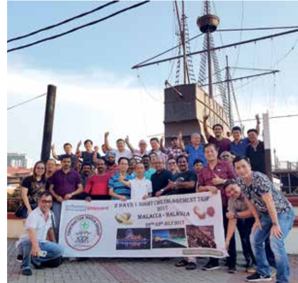
Keppel Shipyard bonded with its contractors over sumptuous local food during the overnight trip to Malacca from 22 – 23 July 2017