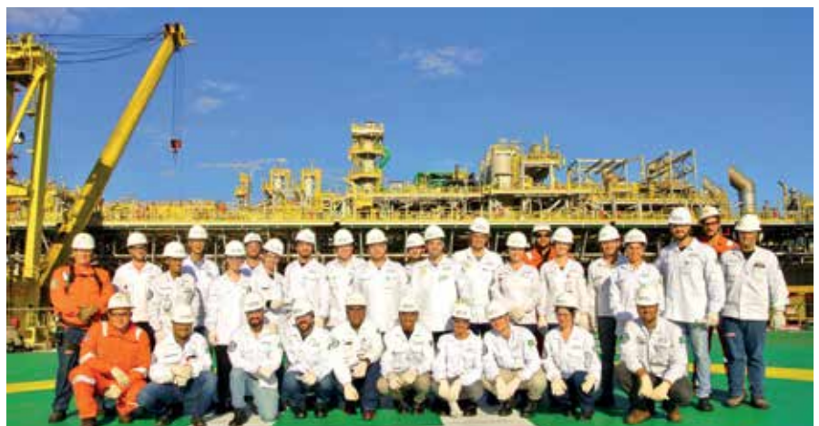
USP students got up close with BrasFELS' projects during their visit to the BrasFELS shipyard