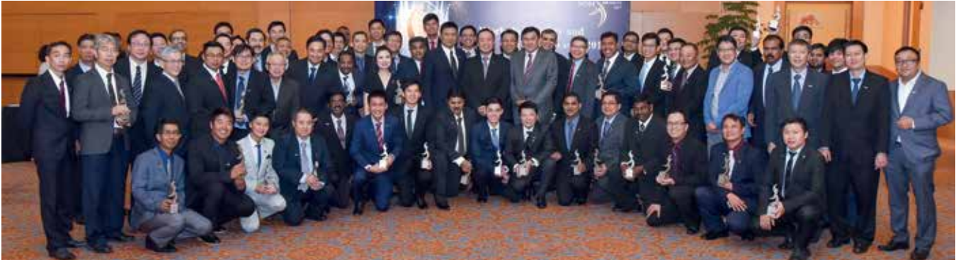
Keppel O&M produced an outstanding safety performance, clinching 32 awards at this year's Workplace Safety and Health (WSH) Awards

Keppel Group has clinched 36 awards at this year's Workplace Safety and Health (WSH) Awards held on 25 July 2017, which was organised by the Workplace Safety and Health Council (WSHC) and Ministry of Manpower (MOM), Singapore. This is the highest number of awards won by a single organisation this year.