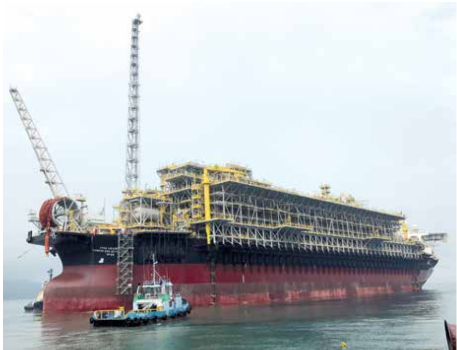
The conversion of the FPSO, Cidade de Campos dos Goytacazes MV29, is BrasFELS' ninth such project for Brazil