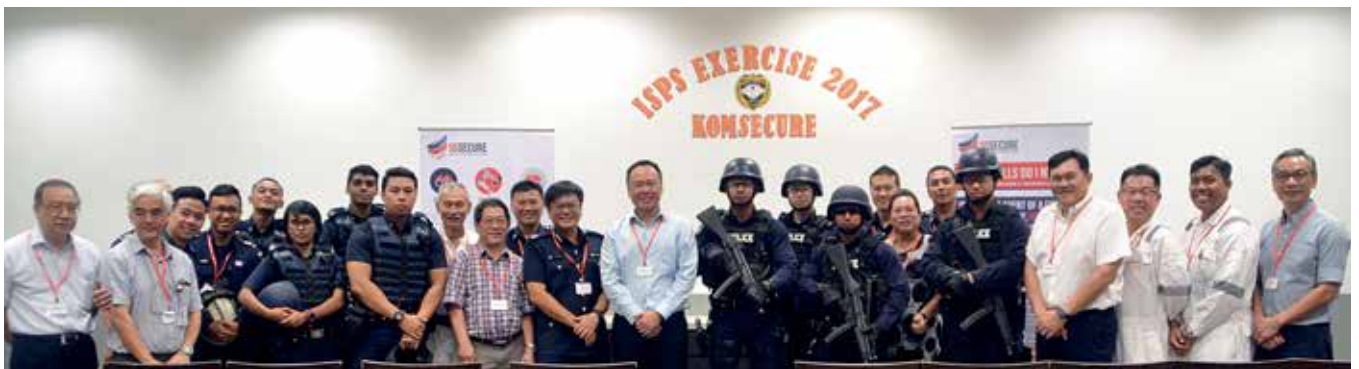
Keppel O&M's security team collaborates with the Jurong West Neighbourhood Police Center for a successful terrorist simulation exercise