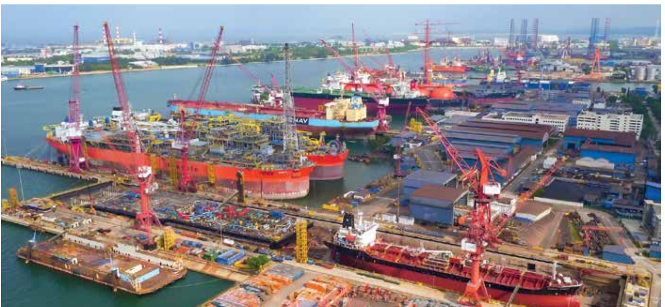
A world leader in FPSO conversions, Keppel Shipyard has secured three FPSO conversion projects in 3Q 2017