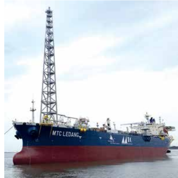
FPSO MTC Ledang was completed safely, in less than five months, for Keppel Shipyard's new client, MTC Engineering

To ensure the smooth completion of the project, Keppel Shipyard and MTC Engineering partnered closely together on all aspects, including the fabrication of a flare tower and foundation; the lifting and integration of a crude stabilisation unit, as well as other refurbishment and life extension works.