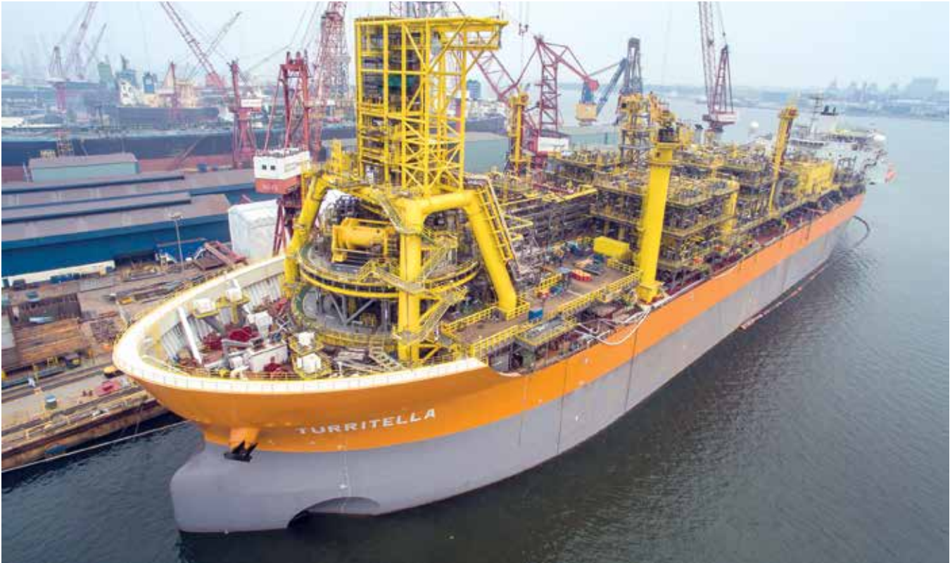
Keppel Shipyard has secured its 25 th FPSO conversion project from long-standing customer SBM Offshore. It previously delivered the FPSO Turitella (pictured) to SBM Offshore

Keppel Shipyard, a wholly-owned subsidiary of Keppel Offshore & Marine (Keppel O&M), announced on 5 October 2017 it secured a Floating Production Storage and Offloading vessel (FPSO) conversion contract from long-standing customer, SBM Offshore N.V. (SBM Offshore).