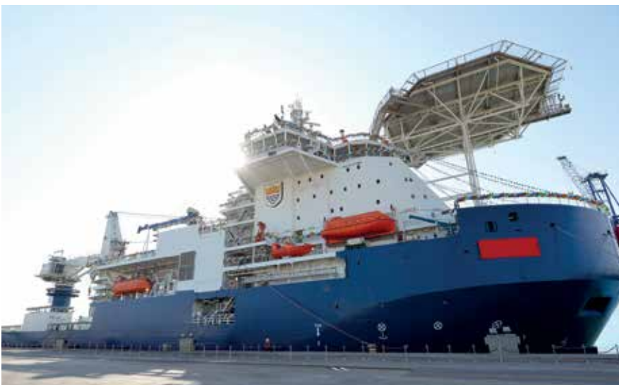
Designed by Keppel O&M and built by Baku Shipyard, the state-of-the-art subsea construction vessel, Khankendi, will install the biggest subsea production system in the Caspian Sea

The vessel is equipped with dynamic positioning to allow working in 3.5 metre significant wave height, a 900 tonne main crane capable of placing 750 tonne subsea structures down to 600 metres below sea level, an 18-man two-bell diving system, two work-class ROVs and a strengthened moon pool.