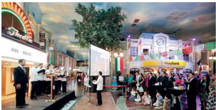
Keppel is a regular sponsor of Mexico's Independence Day celebrations and enjoys strong business and cultural ties with Mexico

rigs for Mexico, Keppel has also repaired and serviced some 18 rigs that have been deployed in Mexico.