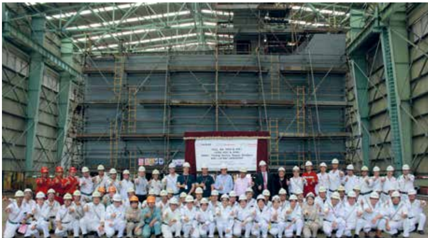
Keppel Singmarine is advancing its efforts in the non-oil and gas sector with the successful keel laying for two Trailing Suction Hopper Dredgers

China. This follows the strike steel ceremony that was held in March this year.