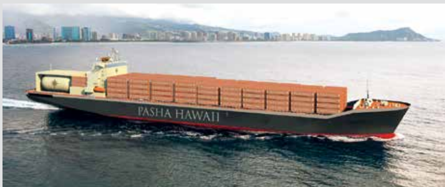
The two state-of-the-art dual-fuel LNG containerships for Pasha will be built to Keppel's proprietary innovative design

Keppel AmFELS, a wholly owned subsidiary of Keppel Offshore & Marine Ltd (Keppel O&M) in the United States (US), announced on 24 August 2017 the securing of a contract from Honolulu-based Pasha Hawaii for the construction of two Liquefied Natural Gas (LNG) fueled containerships.