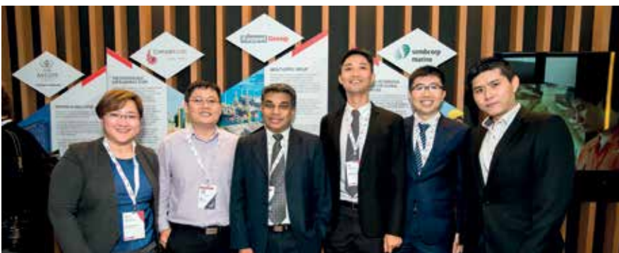
During the Latin Asia Business Forum held on 29 September 2017, the Keppel O&M delegate renewed ties with partners and customers