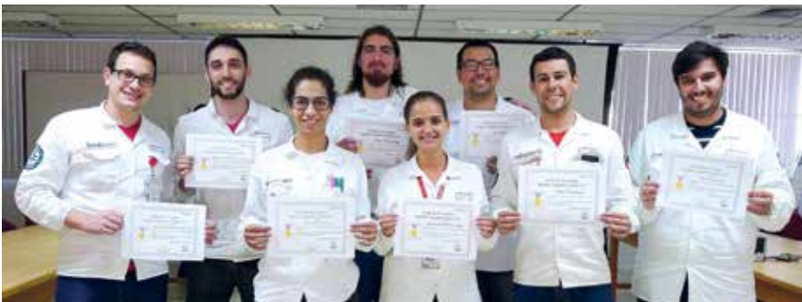
Participants of the 2015 Trainee Engineer Programme celebrated their graduation at a ceremony held on 27 July 2017