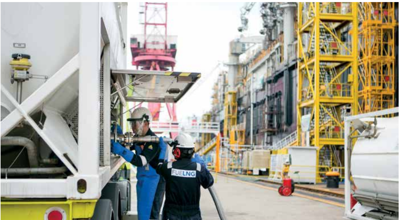
FueLNG, a joint venture between Keppel O&M and Shell, achieved the first commercial LNG bunker transfer in Singapore by completing truck-to-ship bunkering for the Floating Liquefaction (FLNG) vessel, Hilli Episeyo (in background)

According to DNV GL, the use of LNG completely removes SOx and particulates, and reduces NOx and carbon dioxide emissions by 85 percent and at least 20 percent respectively.