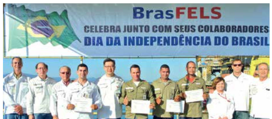
BrasFELS presented Safety Awards to four employees for their exemplary safety performance and efforts

evolve, so that we can remain relevant to the industry. For BrasFELS to remain viable, we must remain committed to excellence, and be able to execute more efficiently and cost-effectively. I urge all of you to continue to work with each other and our external stakeholders to ensure that we remain an attractive workforce and shipyard".