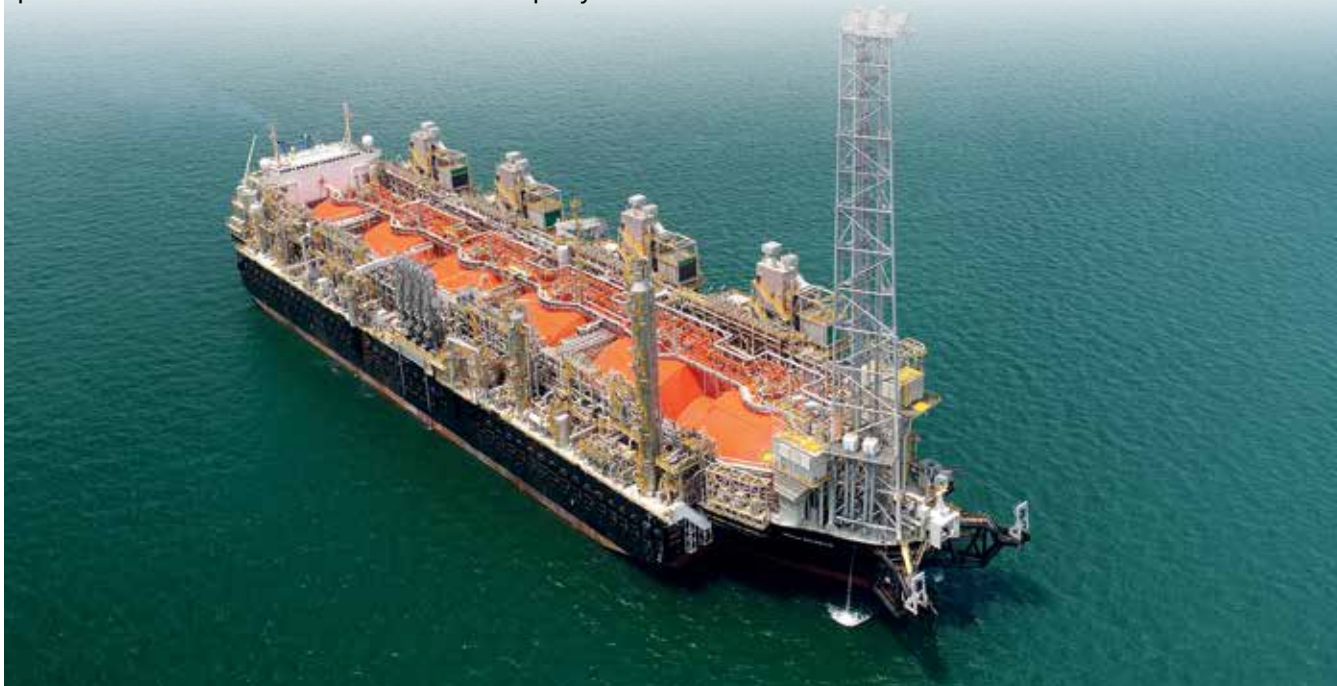
Keppel Shipyard delivered the world's first converted FLNGV, Hilli Episeyo, to the satisfaction of Golar LNG

Keppel will also retain its stake of 10% in Series A units which relates to the cash flows associated with oil price linked elements of the tolling fee negotiated in the liquefaction tolling agreement and 10% of Series B units which relates to the cash flows associated with any future expansion of contracted capacity beyond the present 50% of the Hilli.