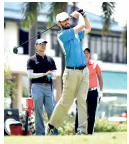
Participants took to the green as they vied for top spot in the Golf Challenge

The following week, paddlers from the three teams fiercely competed