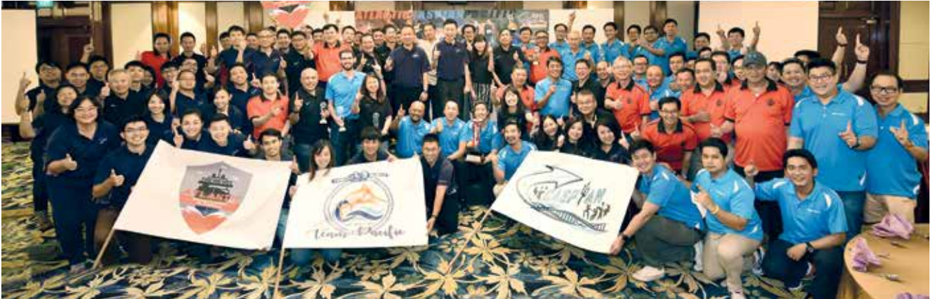
Over 130 Keppelites from across the Group came together for the opening of the 14th Keppel Games

The 14th edition of the annual Keppel Games kicked off with the highly anticipated Opening Ceremony and Golf Challenge held at Raffles Country Club on 25 August 2017.