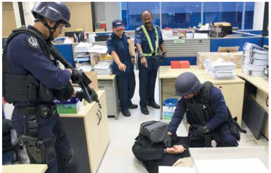
The Keppel O&M security team worked closely with the Jurong West Police in preparing for a terrorist attack on the yard