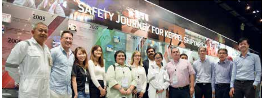
As part of the World Congress on Safety and Health at Work 2017, Keppel O&M shared safety best practices such as the training of its workers at the Keppel Safety Training Centre

Organised every three years by the International Labour Organisation, the World Congress on Safety and Health at Work held in South-East Asia for the first time from 3-6 September 2017 provided a platform for the exchange of knowledge, strategic and practical ideas that promote safety and health at work.